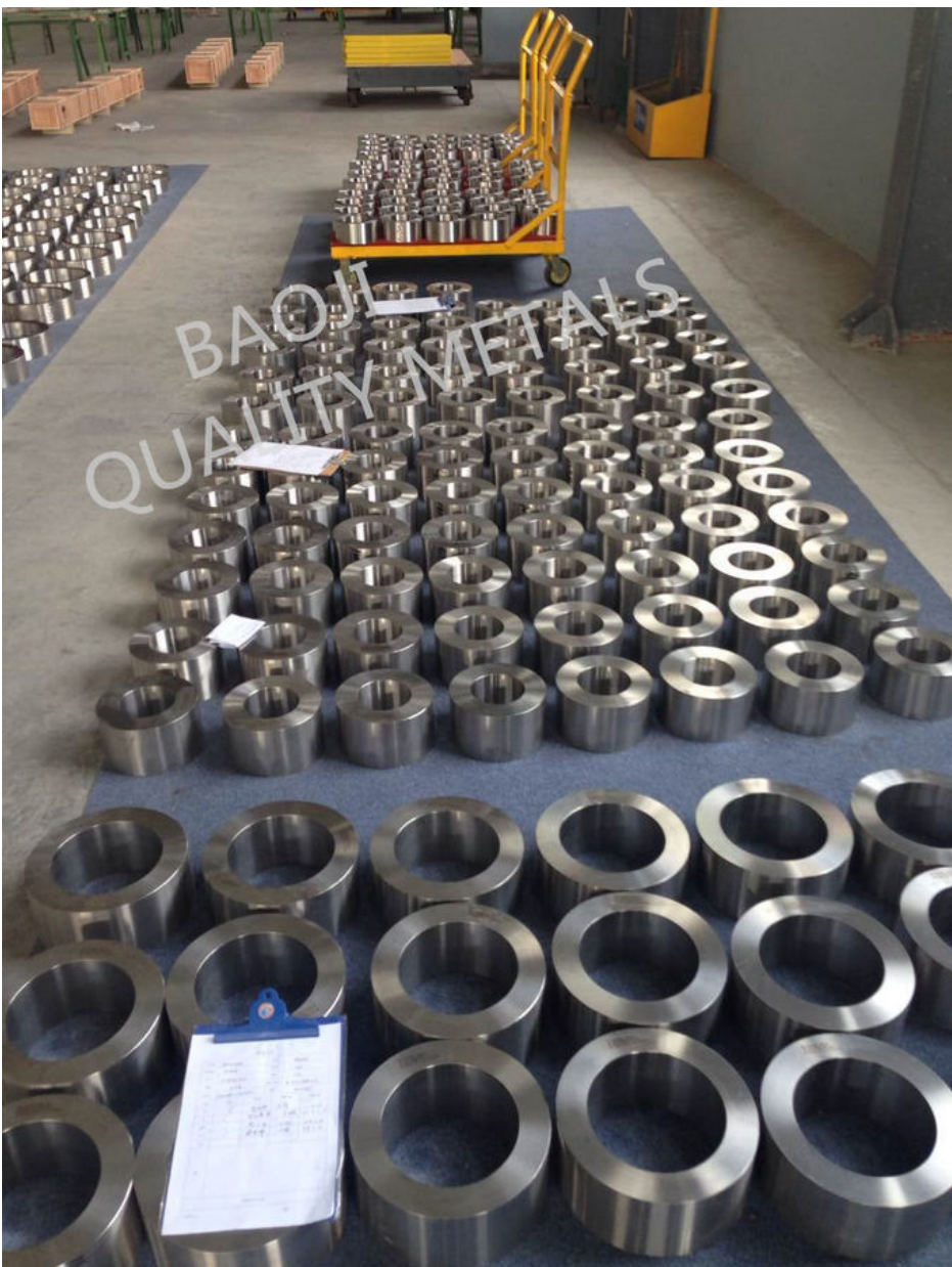
We produce titanium forged rings, titaium flanges, and at the same time can supply its matching titanium pipes, titanium elbows and other accessories