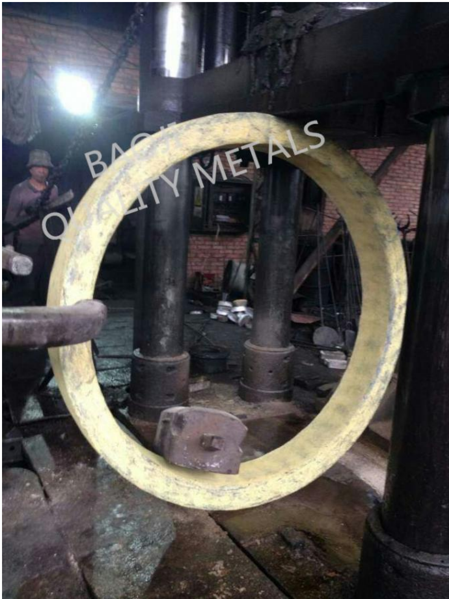
Vertical lathe processing