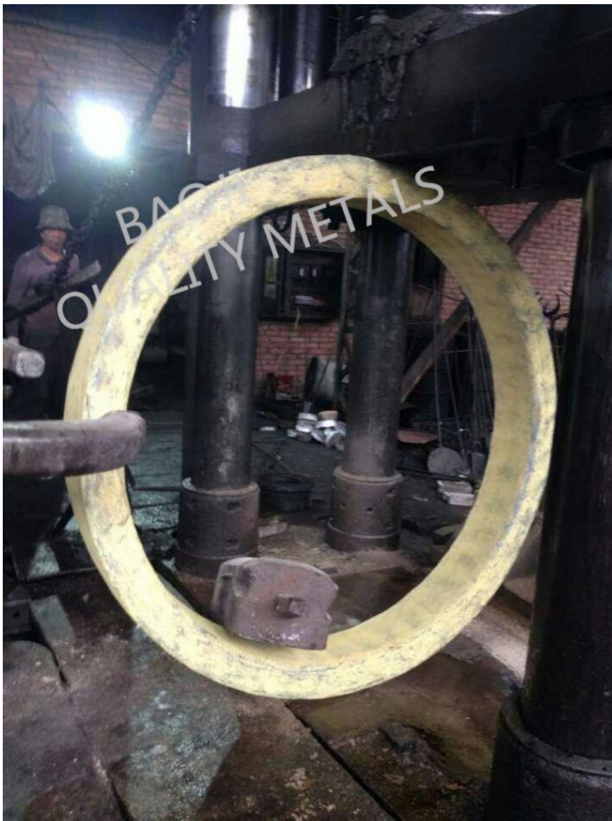
Vertical lathe processing Can process titanium rings within diameter 3000mm , titanium round parts